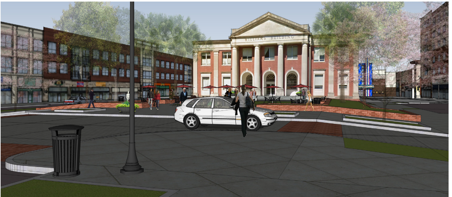
The Commons at Bull Street - Columbia, South Carolina